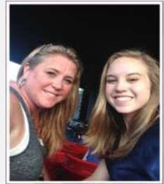
My daughter and me at an Ed Sheridan Concert in 2014